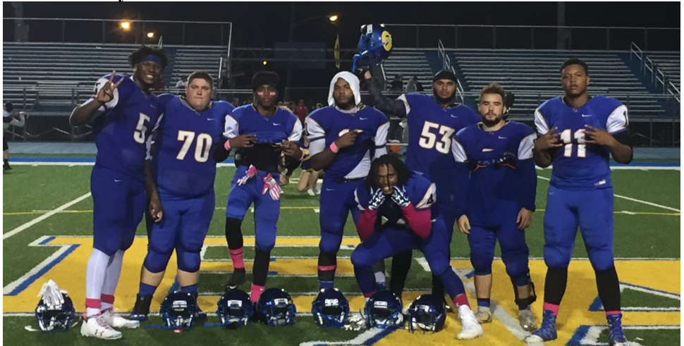
Wildcat seniors celebrate their nail-biting victory after their last homecoming game.